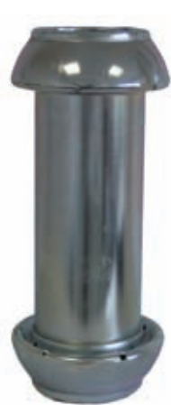
Male-male reversing coupling Type: KDVT...

Other Cardan couplings on request available