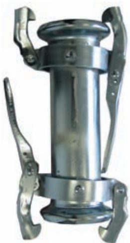
Female-female reversing coupling Type: KDMT...