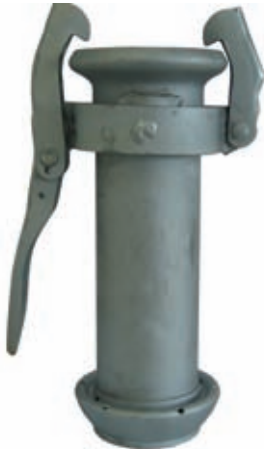
Female-male reversing coupling Type: KGMKV...